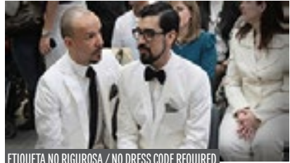
ETIQUETA NO RIGUROSA / NO DRESS CODE REQUIRED