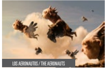
LOS AERONAUTAS / THE AERONAUTS