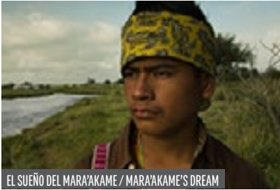
EL SUEÑO DEL MARA'AKAME / MARA'AKAME'S DREAM