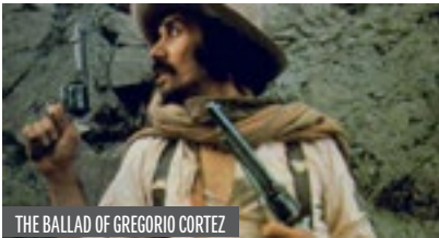
THE BALLAD OF GREGORIO CORTEZ