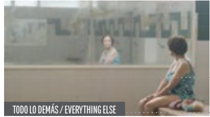
TODO LO DEMÁS / EVERYTHING ELSE

See Friday Oct 27, 1pm event for synopsis.