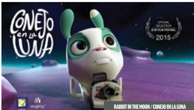
RABBIT IN THE MOON / CONEJO EN LA LUNA

This short tells the story of Meztli, Toxtli, and Zacatuche, three brothers who try taking a very special photograph, and while arguing over who will be in the photograph, a tragedy unfolds. This adventure has the potential of turning the story into a legend.