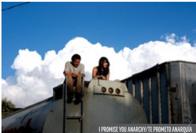
I PROMISE YOU ANARCHY/TE PROMETO ANARQUÍA