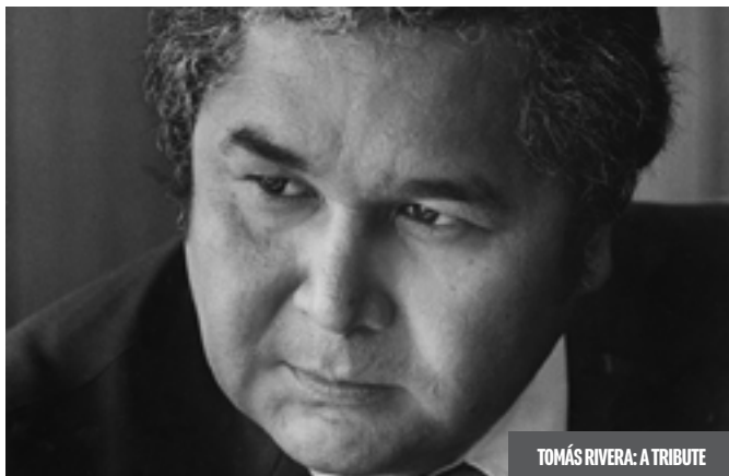
TOMÁS RIVERA: A TRIBUTE